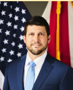
Attorney General James Uthmeier

Plaza Level 05, The Capitol 400 South Monroe Street Tallahassee, FL 32399 (850) 488-4711 Fax: (850) 921-6114