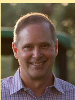
Commissioner Agriculture & Consumer Services Wilton Simpson

Plaza Level 11, The Capitol 400 South Monroe Street Tallahassee, FL 32399 (850) 413-3100 Fax: (850) 413-2950