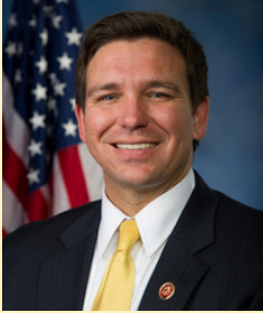
Governor Ron DeSantis

ron.desantis@eog.myflorida.com www.flgov.com